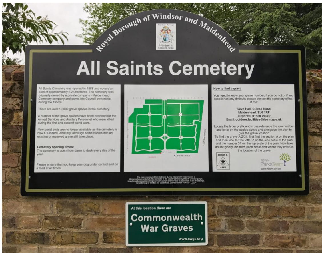
All Saints Cemetery, Maidenhead

All Saints Cemetery, Maidenhead, Berkshire, England contains 61 Commonwealth War Graves. There are 14 graves from World War 1 & 47 from World War 2. There is only 1 Australian Forces burial – Private Norman Edwin Sheldon.