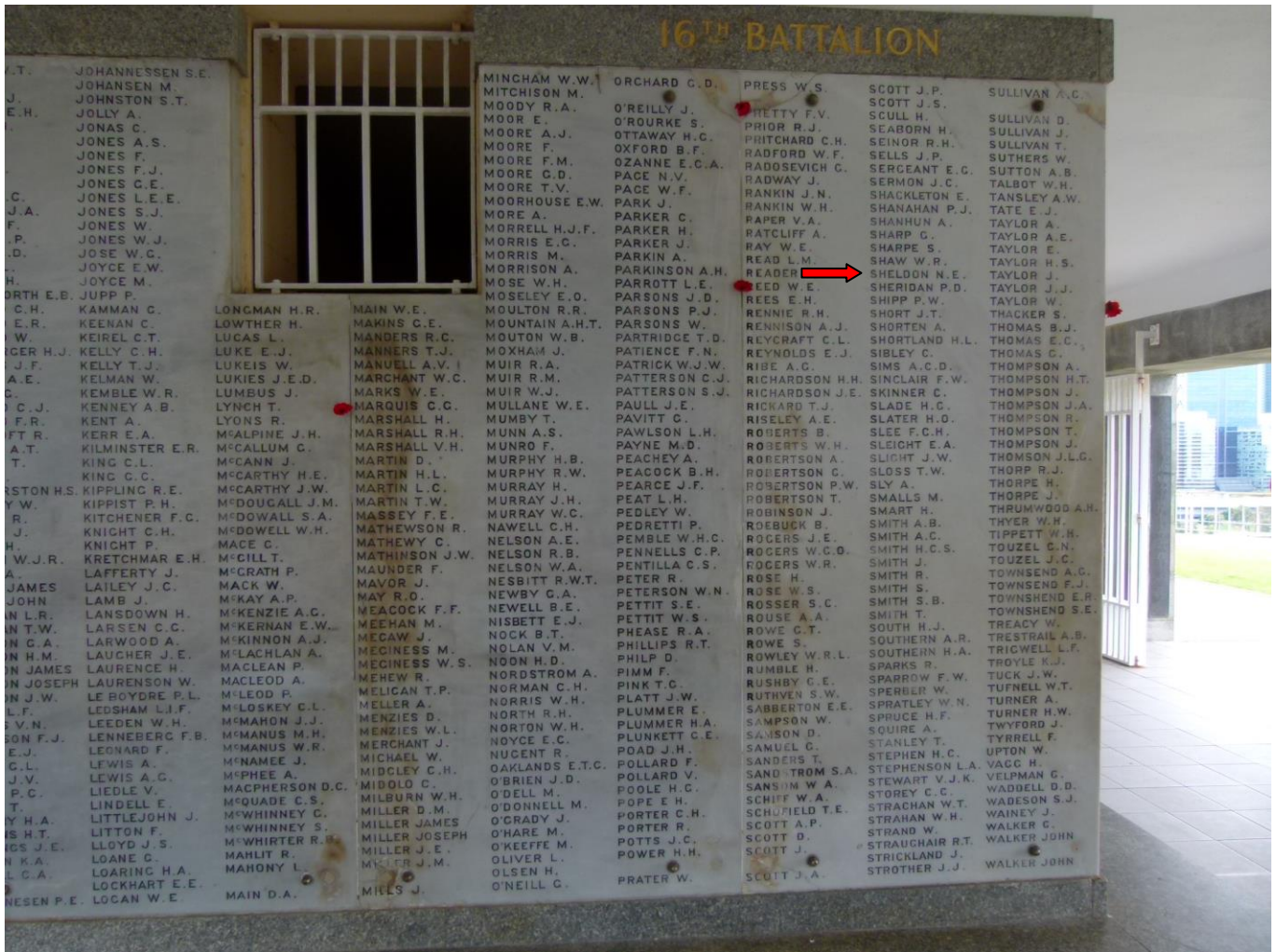
16th Battalion Panel

(58 pages of Private Norman Edwin Sheldon's Service records are available for On Line viewing at National Archives of Australia website).